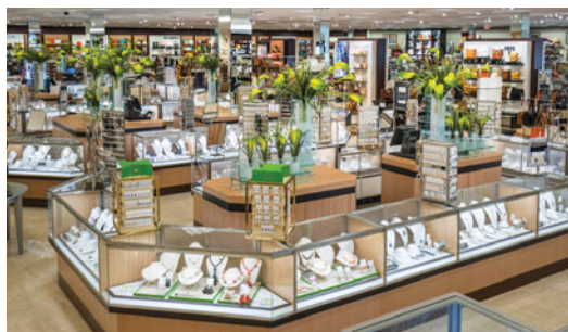
The Mall at Green Hills – Nashville, TN

The look of Gianni Bini, an exclusive contemporary collection with couture sensibility that excites shoppers with fresh, off-the-runway styling.