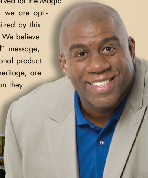
EARVIN “MAGIC” JOHNSON

WHILE LAYUPS are reserved for the Magic Johnsons of the world, we are optimistic about and energized by this opportunity before us. We believe our “no credit needed” message, along with our exceptional product and customer service heritage, are never more relevant than they are today.