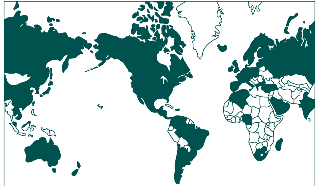
■ ALOT Global Coverage

Astro-Med is a system certified ISO-9001 Company that focuses on product innovation, total quality and customer satisfaction.