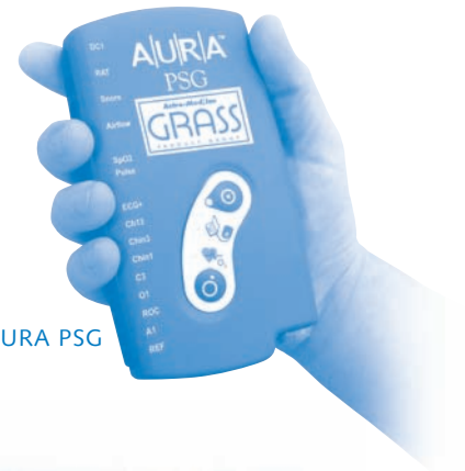
Wireless AURA PSG