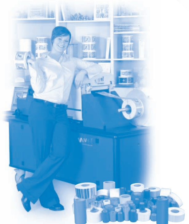
Vivo! with QuickLabel media