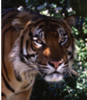
Born Free Foundation