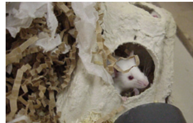
Laboratory mouse making good use of the housing and bedding he has been provided. Denied federal protection, such enrichment is the exception, not the norm.

kept in research facilities. Discussion topics which have been summarized and submitted for publication include: relationships between personnel and animals in the research laboratory; emotionality in the