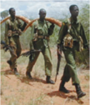
Kenya Wildlife Service

activities to national enforcement bodies as well as international organizations including INTERPOL and the CITES Secretariat. AWI has long been a leader in promoting wildlife law enforcement and supporting the men and women who fight to conserve wild animals and implement the laws vital to their long-term survival.