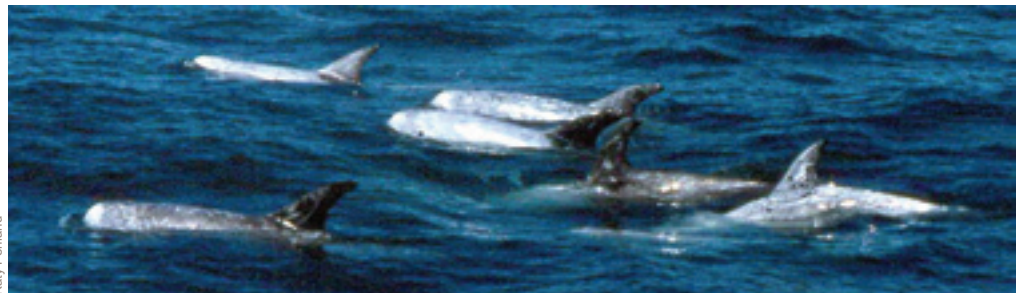
Risso's dolphins are found throughout the world in temperate and tropical waters, including southern California where this adult pod was spotted.

peninsula. We achieved this by alerting the Mexican authorities to the lethal nature of the project, stopping it at the eleventh hour. Four months later, the project's sponsors re-applied, this time partnering with a Mexican University and in concert with a request for a seismic study by a Mexican oil company. Hearings took place