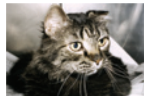
SAPL's efforts in Congress include helping domestic animals slaughtered for food, endangered species around the world and companion animals here at home, stolen and sold to research labs.