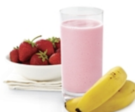
Strawberry Banana Strawberries, banana, low fat frozen yogurt, apple and pear juice.