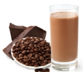
Mocha Espresso coffee, devil's chocolate sauce, ice-cream and milk.