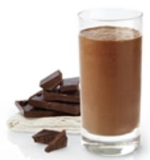
Chocolate Mudslide Devil's chocolate sauce, ice-cream and milk.