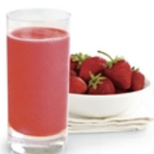
Strawberry Strawberries, sorbet and fruit juice blend.