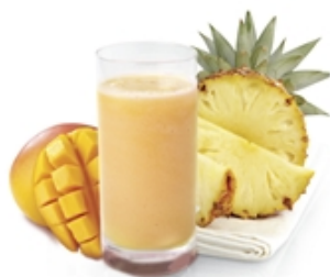
Caribbean Strawberries, pineapple, sorbet, tropical juice.