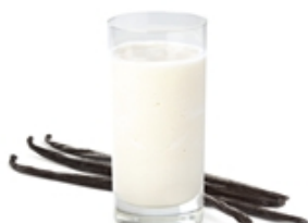
Vanilla Vanilla bean, ice-cream and milk.