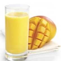
Mango Mangos, low fat frozen yogurt, apple and pear juice.