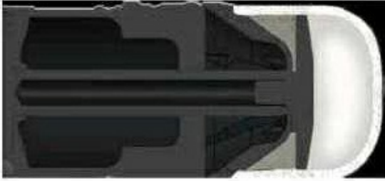
Prior to Impact