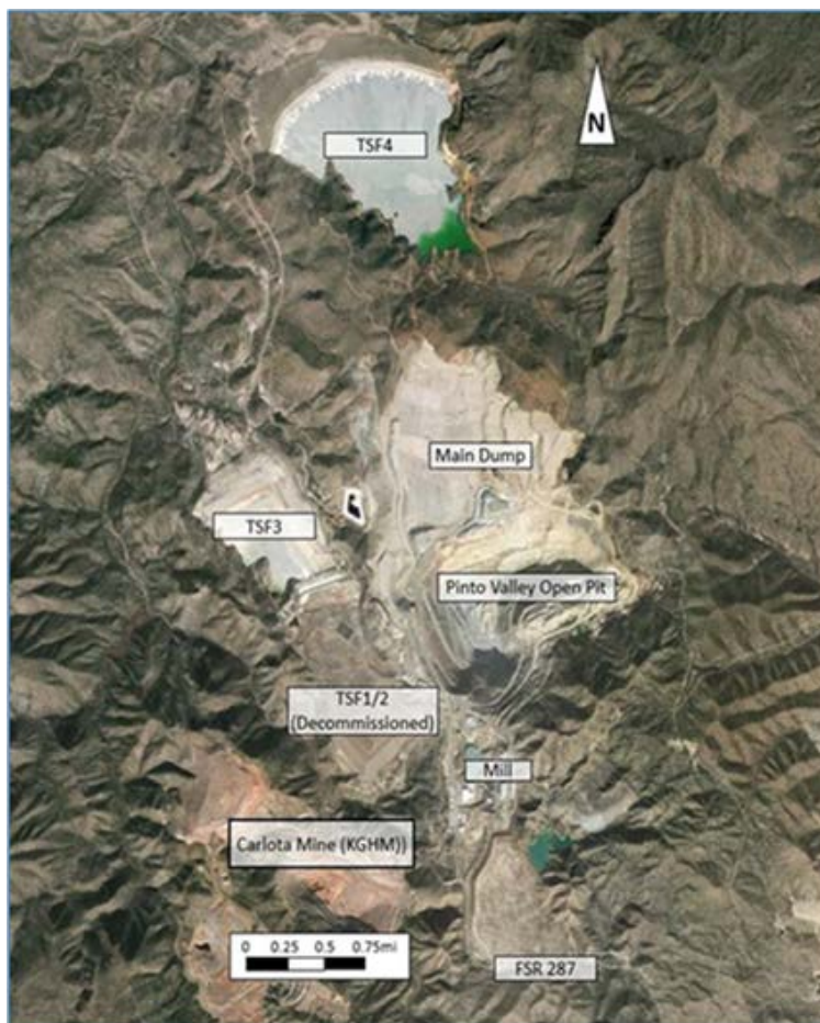
FIGURE 1: PINTO VALLEY INFRASTRUCTURE AND LOCATION OF OPEN PIT

Tailings are deposited in existing permitted tailings storage facilities. Tailings Dam No. 4 is the primary storage facility, with Tailings Dam No. 3 used during maintenance activities at Tailings Dam No. 4 (Figure 1). Pinto Valley Mine has several water sources including a private wellfield with three wells, a pipeline network connecting it to several neighboring mines, a system of water catchments with pumpback capabilities, and reclaim systems on operating tailings impoundments however, periodic drought remains a risk.