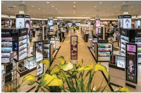
The Mall at Green Hills – Nashville, Tennessee