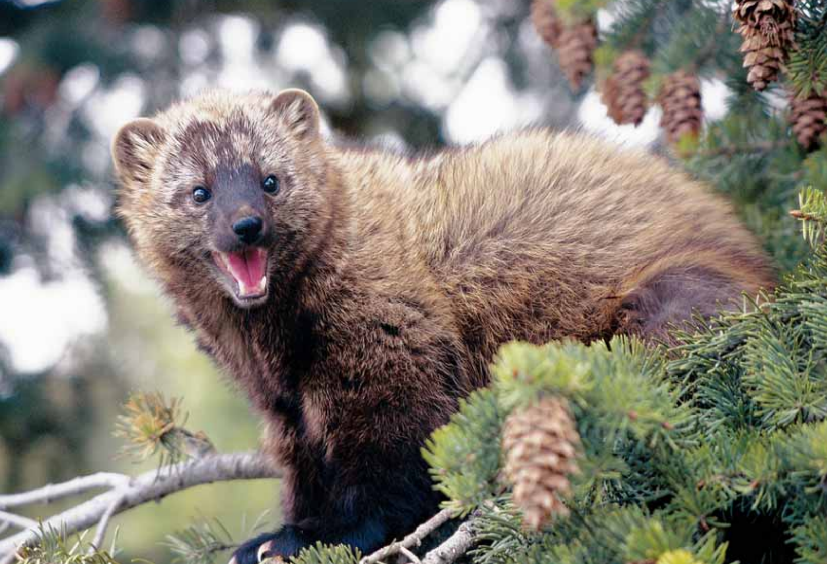
Fisher in an evergreen