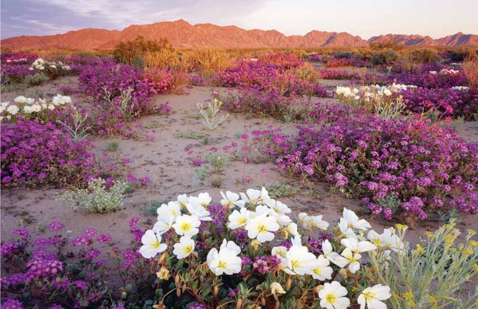
Cabeza Prieta National Wildlife Refuge, Arizona