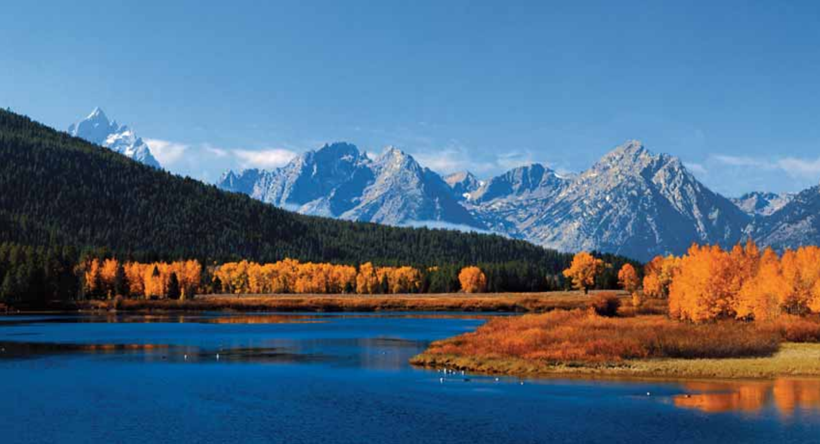
Fall color in Grand Teton National Park, Wyoming

The Endangered Species Act is one of our nation's most important tools for safeguarding the natural legacy we pass on to our children. Defenders is leading efforts to protect this landmark law from attacks in Congress.