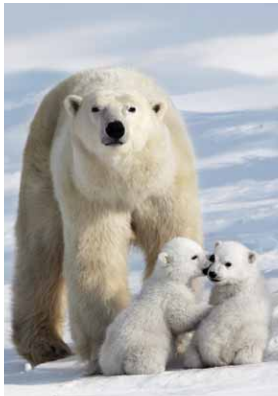
Polar bear mother with cubs

In late 2004, we also released what have turned out to be some of our most popular PSAs on the topics of forests, wildlife refuges, polar bears and manatees.