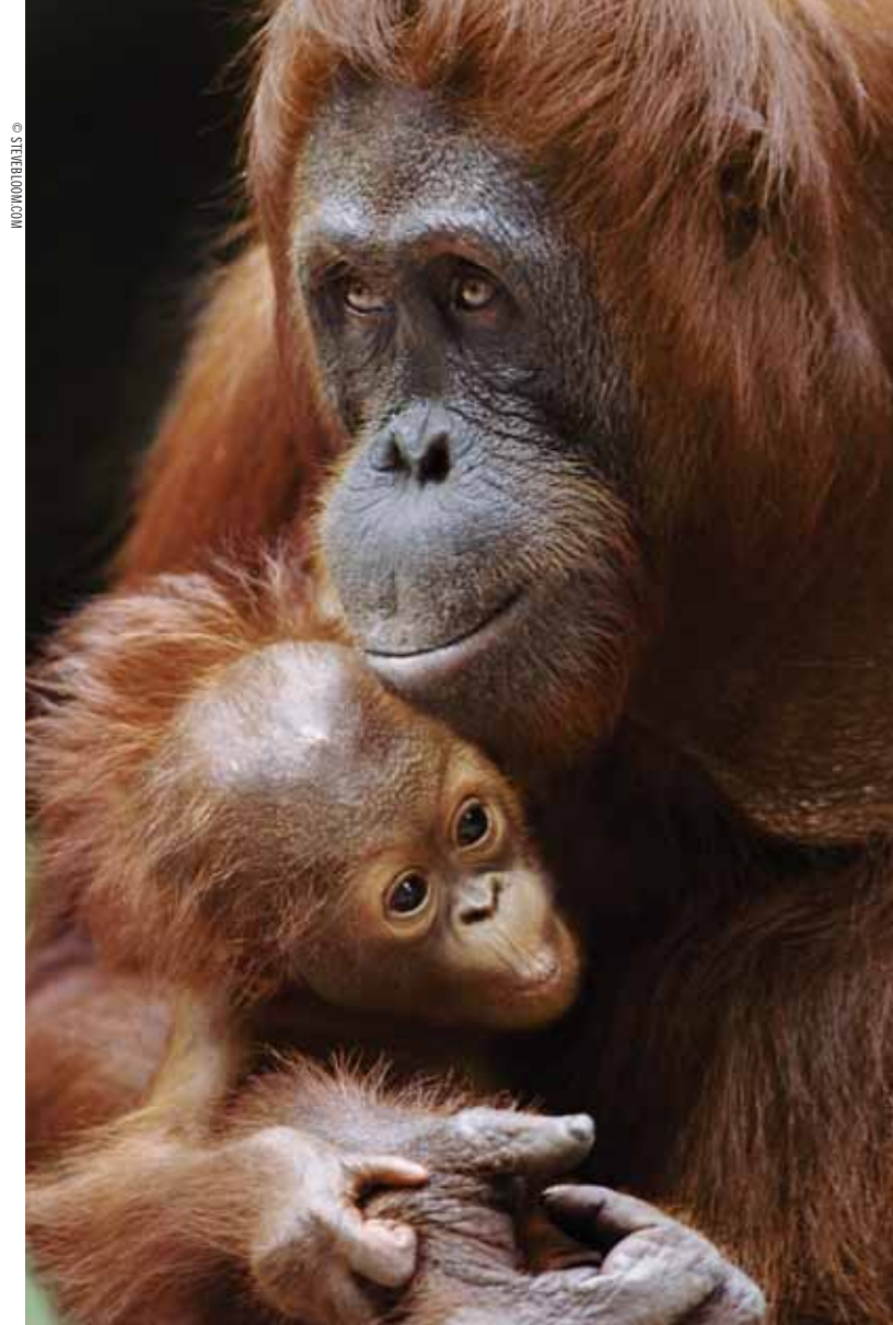
Orangutan mother and infant in Borneo

Defenders spearheaded a campaign against the Bush administration's move to expand commercial imports of endangered animals into the United States. The administration's action flew in the face of 20 years of bipartisan support for strict limits on wildlife commerce. Defenders organized tens of thousands of public comments and released a letter from 358 scientists, including Jane Goodall and Edward O. Wilson, criticizing the science behind the proposal and urging the Bush administration to abandon it. In response to