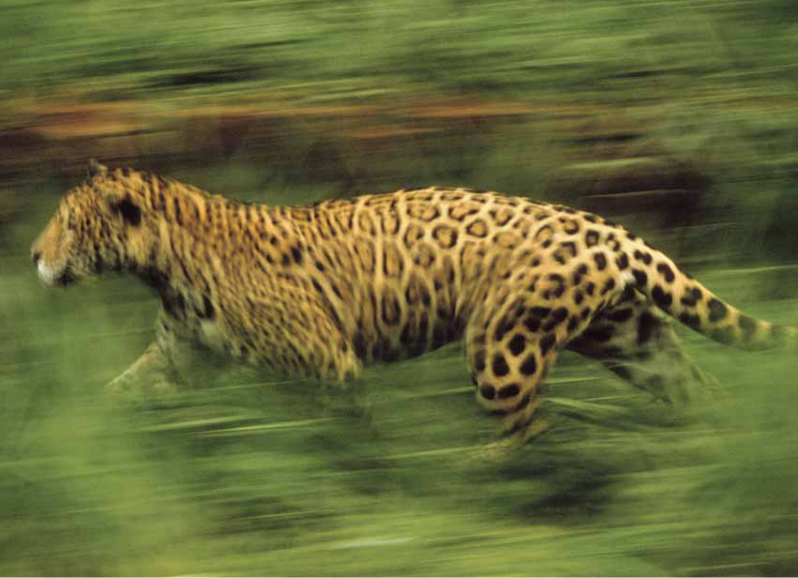
Jaguar in the Amazon, Brazil