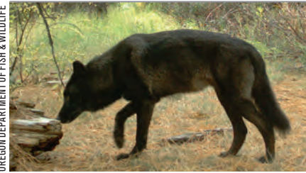
OREGON DEPARTMENT OF FISH & WILDLIFE

90+ educational workshops and trainings to teach ranchers and others how to deploy fladry, foxlights and other deterrence tools to reduce conflicts between predators and ranchers.