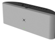
Figure 3 below shows the WattUp PowerHub

In 2016, we introduced our WattUp Near Field Transmitter Technology and a small form factor receiver, which were developed as a result of our efforts to reduce cost and size. This contact-based charging solution, for which we have received FCC approval, allowed for low power charging at up to five millimeters. In 2017, we announced a higher-power version of our WattUp Near Field Transmitter technology, with the ability to charge on contact at levels of up to 10 watts. In February 2019, we announced that our latest WattUp Near Field High Power transmitter technology supports up to 20 watts of charging power. Due to its low cost and small size, the miniature transmitter can be bundled in-box with WattUp-enabled receiver devices, replacing alternative charging solutions like power adapters and charging cables. We expect adoption of our low cost, portable charging solution for receiver devices to continue to advance.