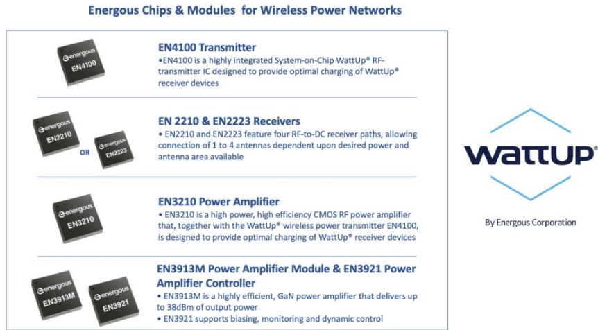
Figure 1 below shows the current IC product line for Energon:

Our small form factor antennas and one transmitter to many receivers capabilities represent significant advantages over RF-beamforming transmitters, which are larger, and higher cost WPT implementations. Our current generation ICs have significantly reduced the size and cost of both transmitter technology and our receiver technology, and products under development are designed to further reduce size and cost. In addition, our ICs are designed for both lower-power and higher-power applications, efficiency and faster synchronization, while working within the constraints of multiple international regulatory environments.