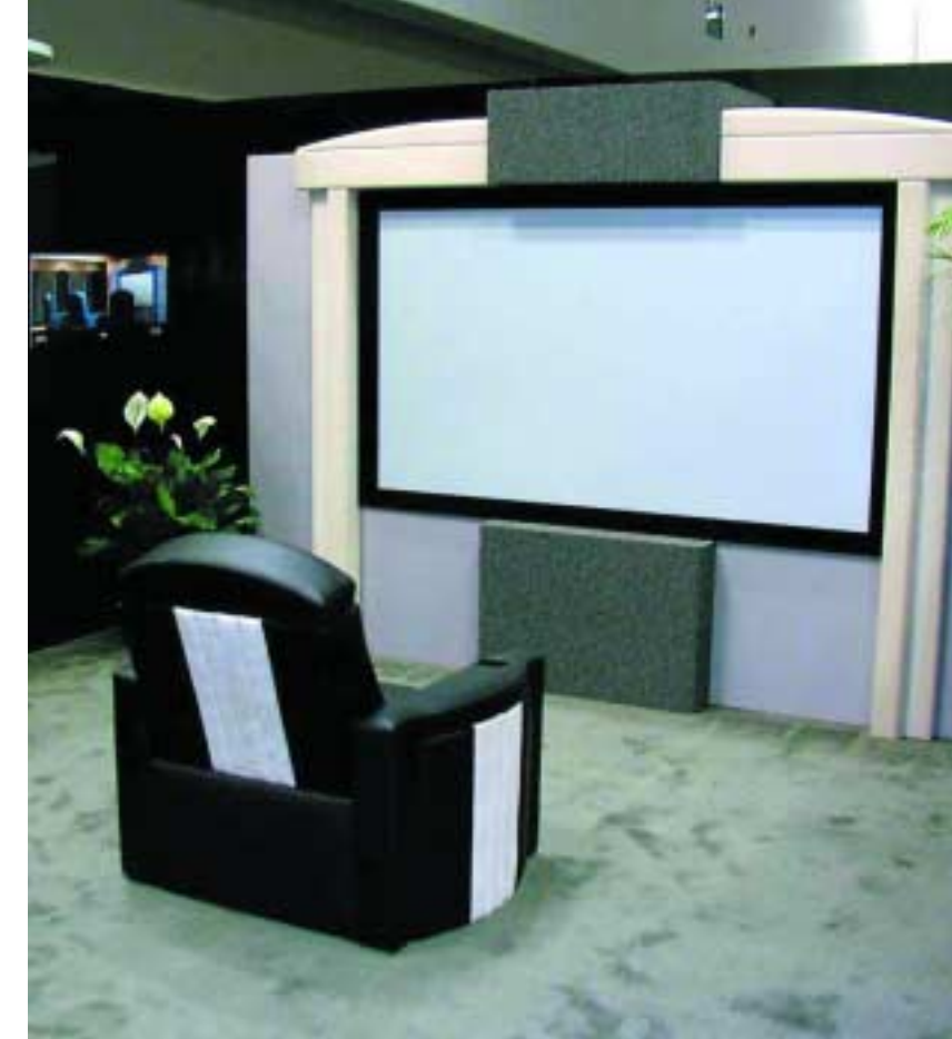
Home Theater System, flexcel

We continue to build strong customer relationships.