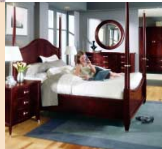
Sophisticate Series Bedroom Furnishings, Kimball Home

Personal modular home theater systems represent one area in which our flexcel manufacturing operations are serving customers and focusing on building new markets. Our customers and global business partners know that we are responsive. Our brand promise is rapid, customized contract manufacturing solutions. Our commitment to outstanding quality, reliable delivery and service nurtures long term customer relationships, proving our worth as a silent partner.