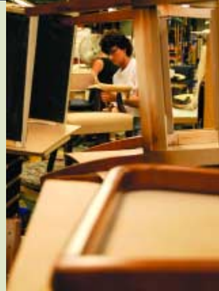
Chair Frame Production, flexcel - 11th Ave.

Those that have gotten to know us view Kimball as an employer of choice. That means more than just providing good, quality work environments for our employees. It's about providing a culture where our people can best serve our customers and realize their own potential. It's about being a sought-after place to work and a responsible corporate citizen that helps our communities improve their quality of life. Guided by a consistent set of principles and a singular Kimball culture, we think globally and act locally all across the world.