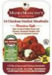
Chicken Florentine Stuffed Meatballs