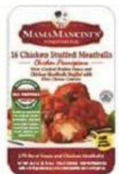
Chicken Parmigiana Stuffed Meatballs