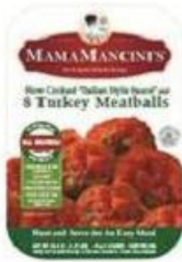
Gluten Free Turkey Meatballs