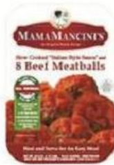
Gluten Free Beef Meatballs