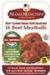
16 Beef Meatballs