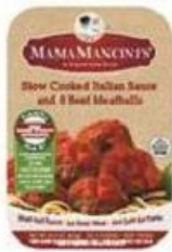
Antibiotic Free Beef Meatballs

Our current turkey meatball products include: