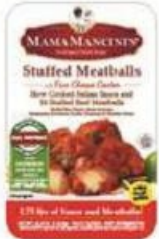
16 Five Cheese Center Beef Stuffed Meatballs