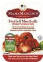
Chicken Parmigiana Stuffed Meatballs