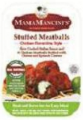
Chicken Florentine Stuffed Meatballs