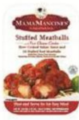
5 Cheese Center Beef Stuffed Meatballs