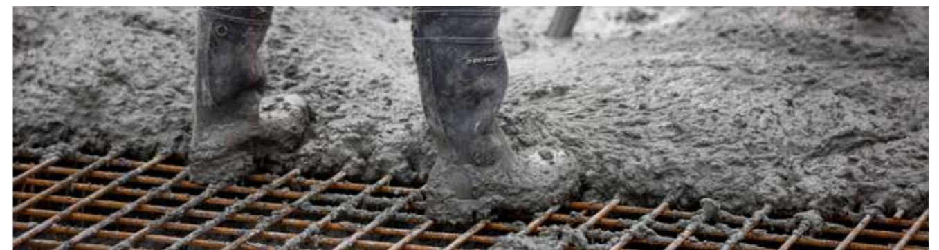
Casting of foundation at PensionDanmark's Kronløbsøen construction project, Copenhagen