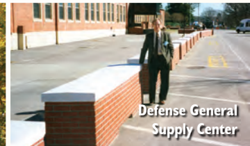
Defense General Supply Center