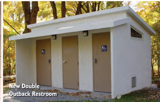
New Double Outback Restroom