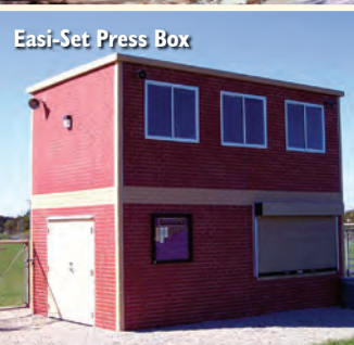
Easi-Set Press Box