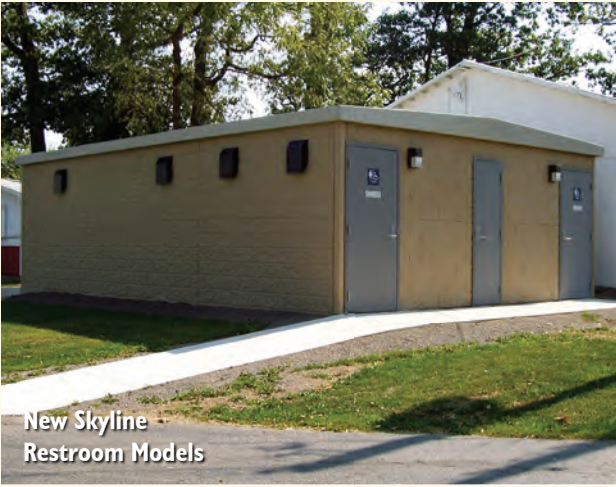
New Skyline Restroom Models