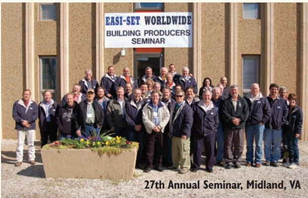
27th Annual Seminar, Midland, VA