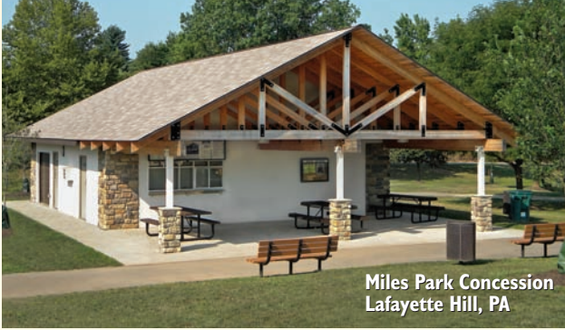
Miles Park Concession Lafayette Hill, PA