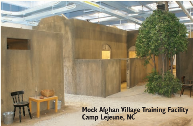
Mock Afghan Village Training Facility Camp Lejeune, NC