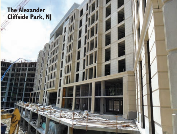
The Alexander Cliffside Park, NJ