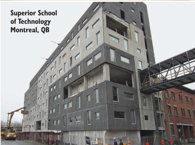
Superior School of Technology Montreal, QB