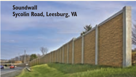
Soundwall Sycolin Road, Leesburg, VA