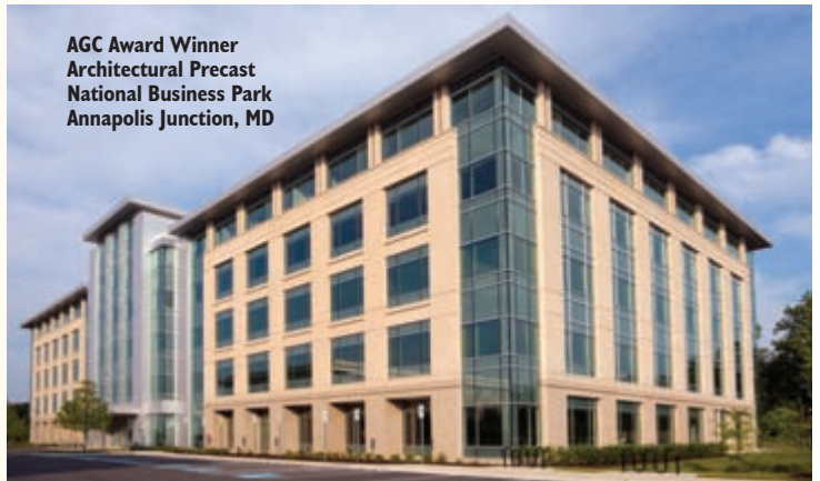
AGC Award Winner Architectural Precast National Business Park Annapolis Junction, MD