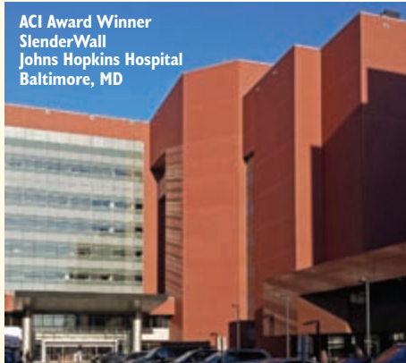
ACI Award Winner SlenderWall Johns Hopkins Hospital Baltimore, MD