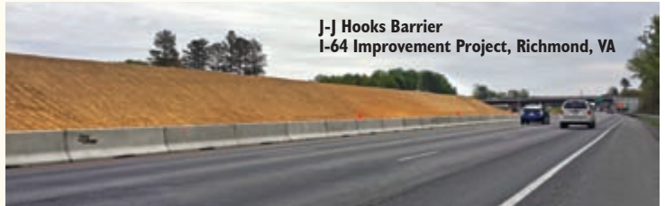
J-J Hooks Barrier I-64 Improvement Project, Richmond, VA

SMITH-MIDLAND ® EXCELLENCE IN PRECAST CONCRETE