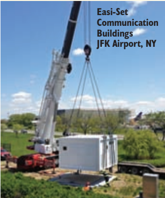
Easi-Set Communication Buildings JFK Airport, NY