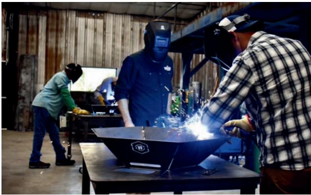
Welding class at The Workshop by TBK Bank