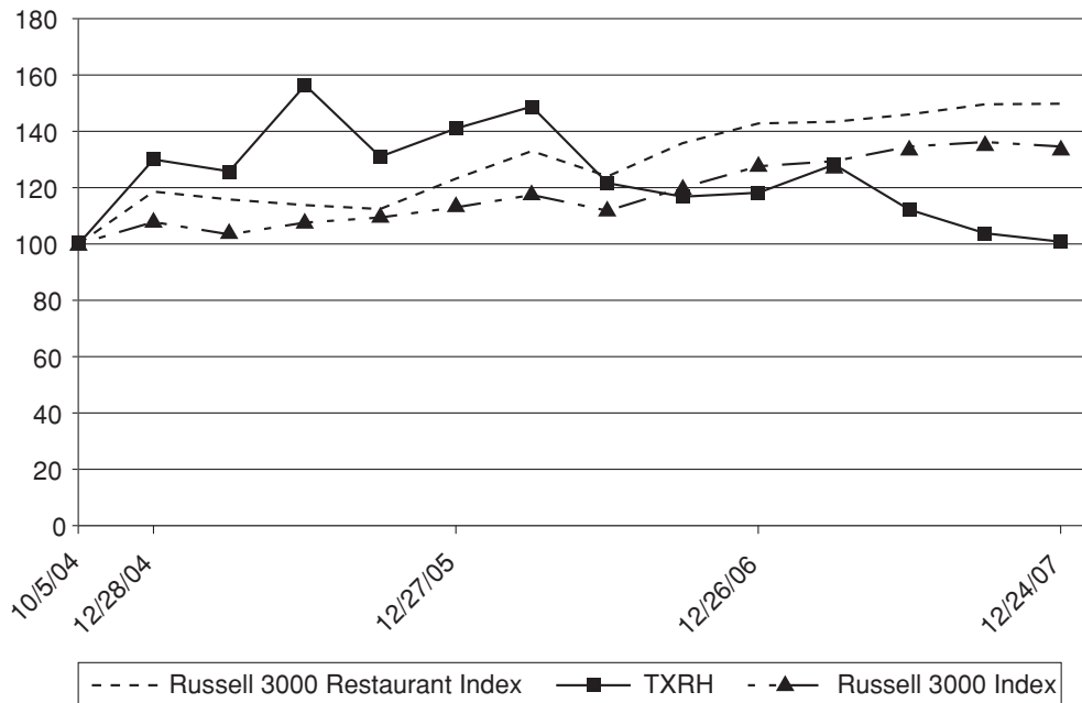
Comparison of Cumulative Total Return Since October 5, 2004 Among Texas Roadhouse, Inc., the Russell 3000 Index, and the Russell 3000 Restaurant Index

Note: The stock performance shown on the graph below does not indicate future performance.