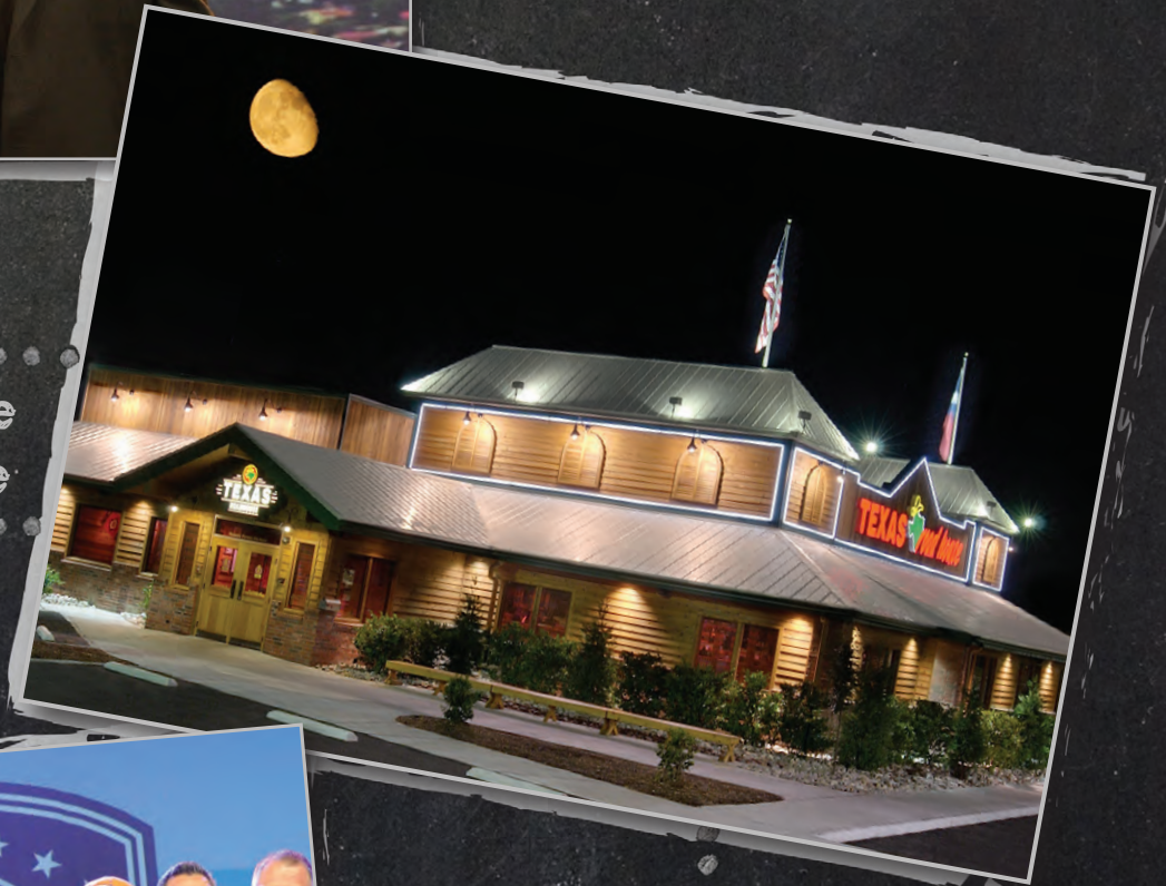
483 Texas Roadhouse Locations Worldwide