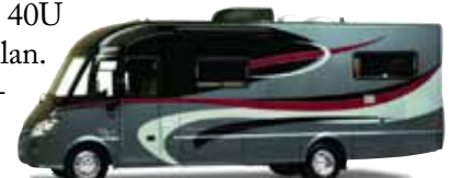
2011 Itasca Rey