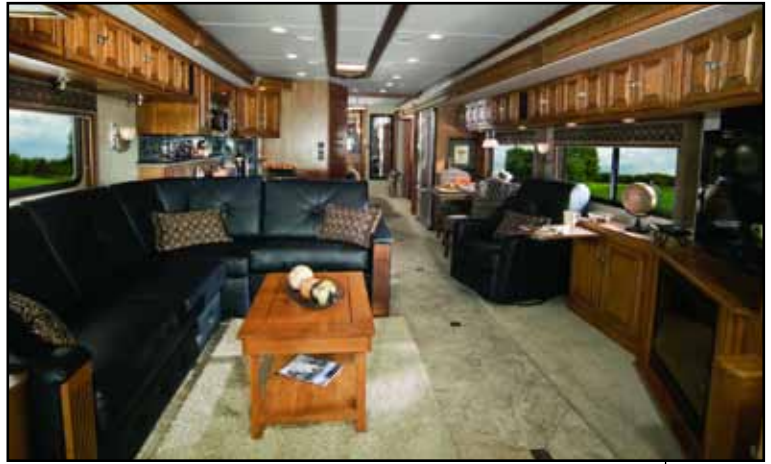
2011 Itasca Ellipse 42QD

Our 2010 model year products, particularly the Winnebago Via and Itasca Rey, as well as the Winnebago Tour and Itasca Ellipse, were extremely