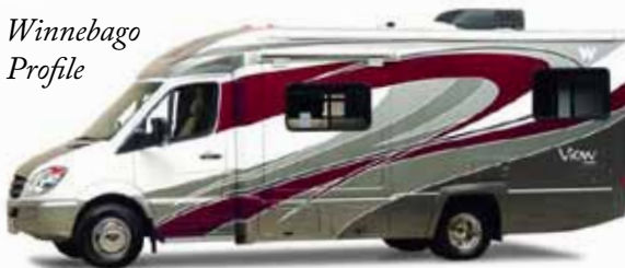
2011 Winnebago View Profile

Our 2010 model year products, particularly the Winnebago Via and Itasca Rey, as well as the Winnebago Tour and Itasca Ellipse, were extremely