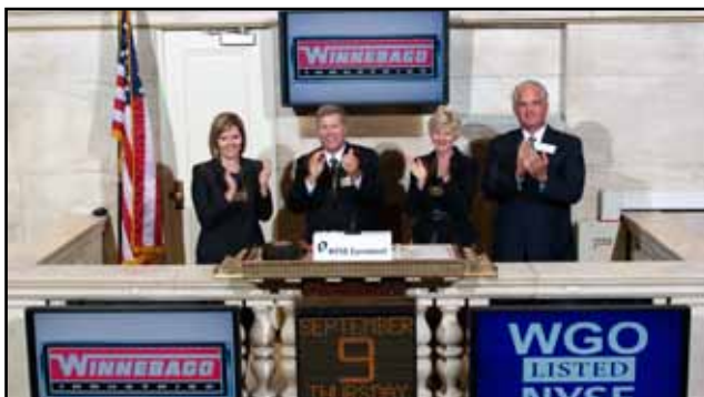
Winnebago Industries personnel were honored to ring the Closing Bell on the NYSE on September 9, 2010 in honor of the 40th anniversary of the Company's listing.

Lean is truly a journey, not a destination. We utilize many tools in the lean process such as value stream mapping, Kaizen (Japanese for ‘improvement’ or “change for the better”), 5S system (which focuses on a systematic approach for productivity, quality and safety improvement), cellular/flow manufacturing, setup reduction, pull systems/Kanban (scheduling system) and lean office. We have also begun to utilize scoreboarding which provides better communication and measurements to help align corporate goals from the top down to front line employees. This is one more tool we can use to assist in the production and delivery of our high quality and innovative products.