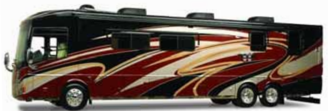
2011 Winnebago Tour

We plan to continue to build upon our Class A momentum and freshen our Class C lines with the introduction of our 2011 model year products: