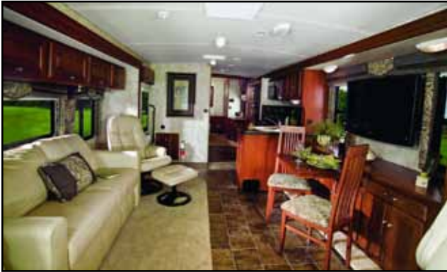
2011 Winnebago Sightseer 33C